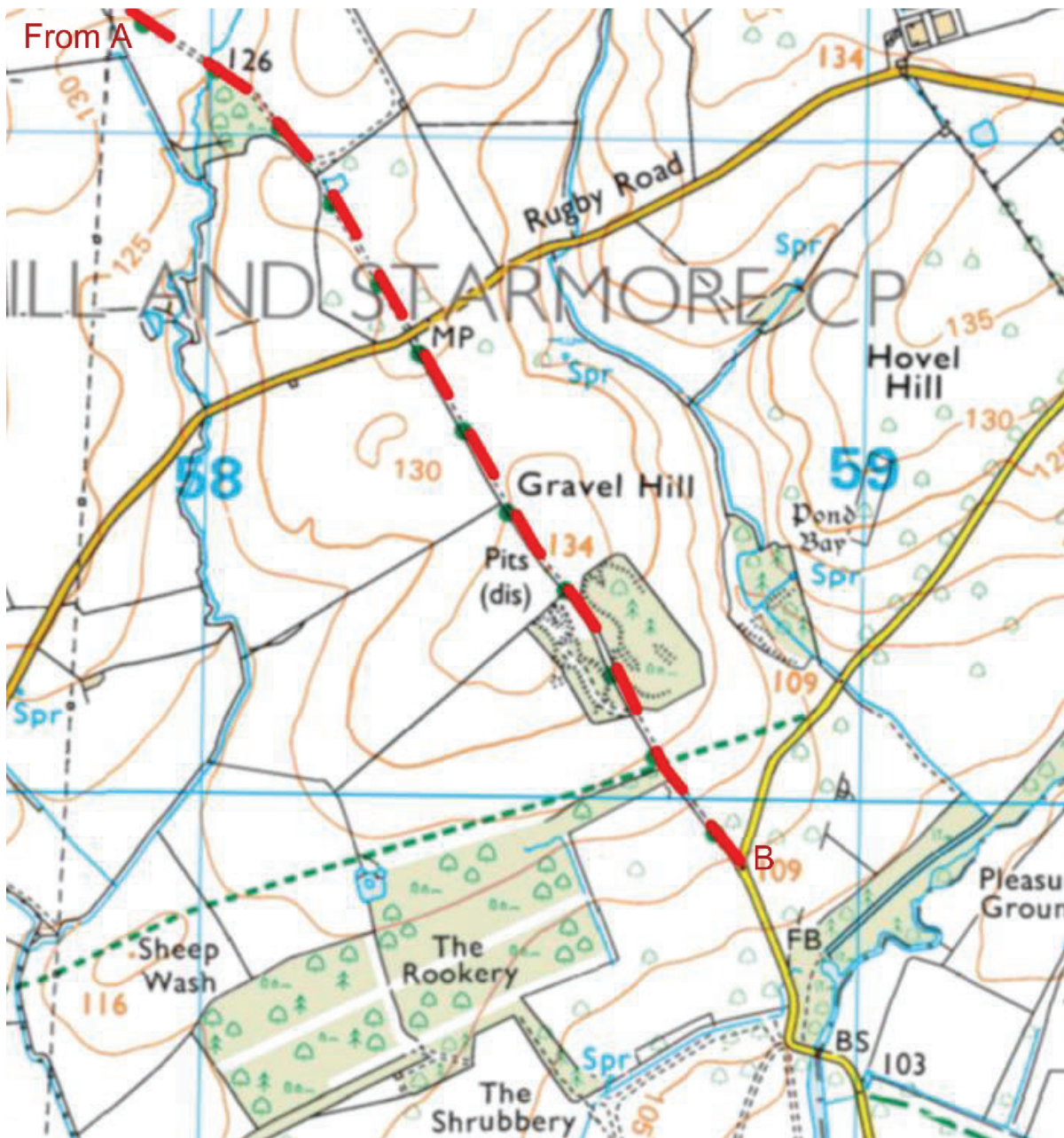
Map produced from extract of Ordnance Survey 1:25,000 scale mapping. When printed on A4 paper, the scale will be not less than 1:25,000 and thus meets the requirement of regulation 2 and regulation 8(2) of The Wildlife and Countryside (Definitive Maps and Statements) Regulations 1993.