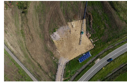
Drainage installation works