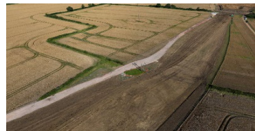
Haul Road 80% complete

https://kuula.co/post/n1/collection/7JVWn