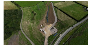
Severn Trent Water diversion