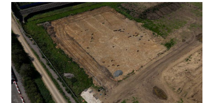
Archaeological works 80% complete