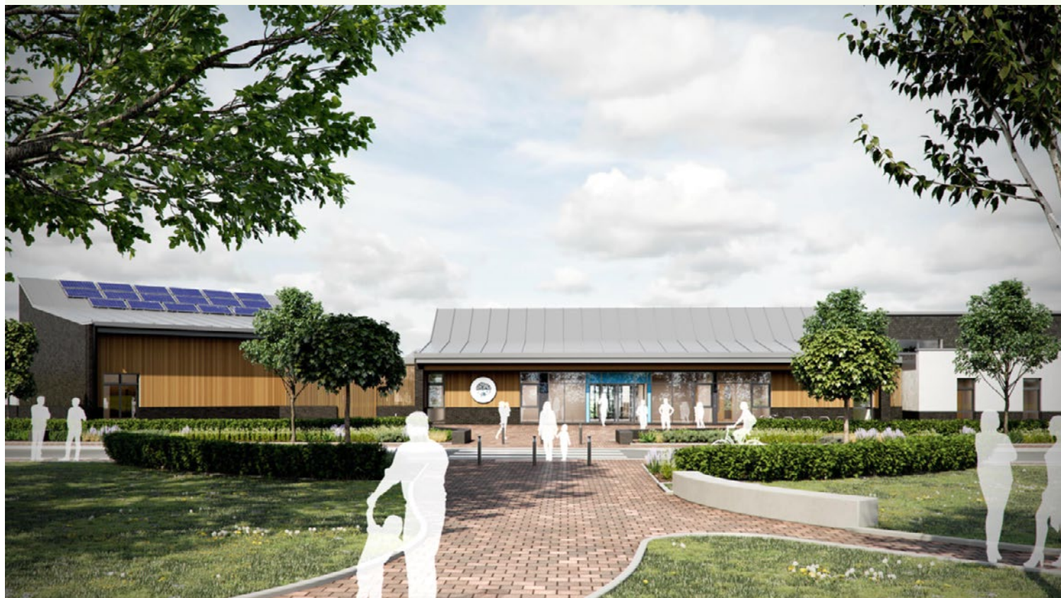
Greenstone Primary School, Leicestershire's first forest school opening Autumn Term September 2025. For more information please visit: www.greenstone.org.uk

If you require this information in an alternative version such as large print, Braille, tape or help in understanding it in your language, please contact 0116 305 6684 , minicom: 0116 305 6048 or email: admissions@leics.gov.uk