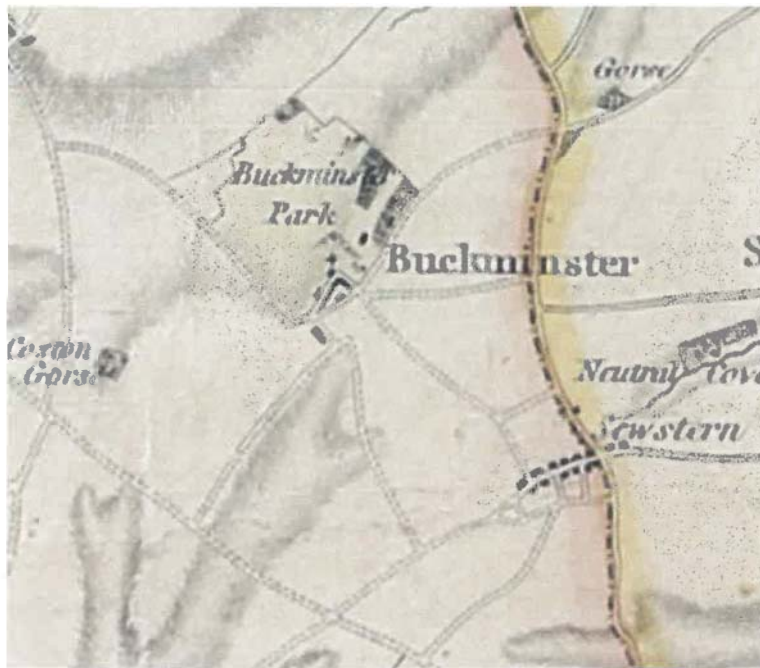
Kings Map 1806 claimed route shown as public carriage road