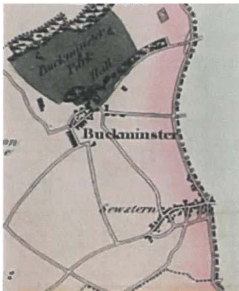
Greenwoods Map of Leicestershire 1826 Showing claimed route as a cross road