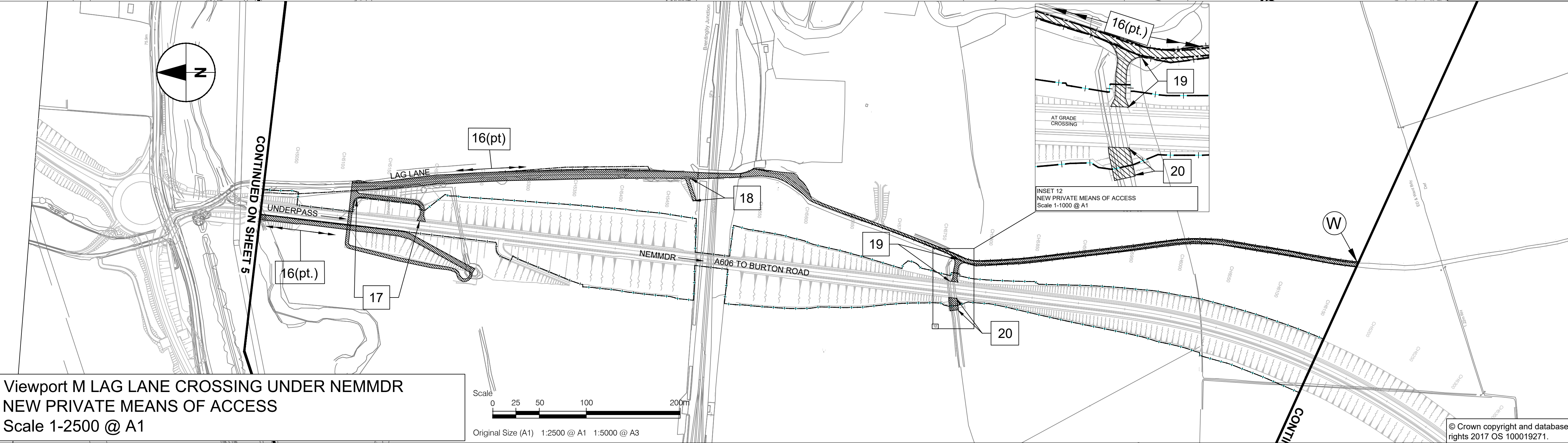
Viewport M LAG LANE CROSSING UNDER NEMMDR NEW PRIVATE MEANS OF ACCESS Scale 1-2500 @ A1