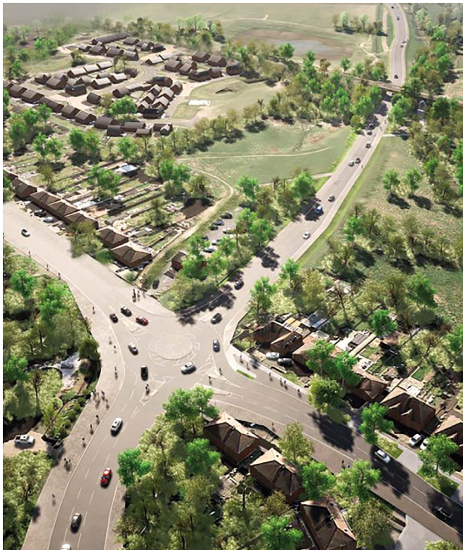
Artist's impression of the new Link Road looking southwards from the A511.

Due to the scale of works proposed at this location, this element of the project will require planning permission and the project team are in the process of preparing the relevant material to submit a planning application in early 2022.