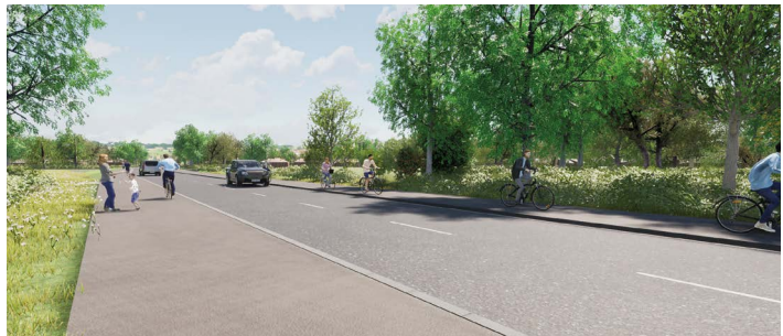
Artist's impression of the new Link Road looking north towards the A511 and Coalville.

Leicestershire County Council are continuing to work through the DfT's funding process and on the basis the scheme continues to represent good value for money and secures the necessary funding from the DfT, and subject to the necessary Cabinet approvals, we will look to commence construction in 2024.