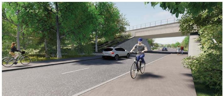
Artist's impression of the new Link Road looking south towards the railway.