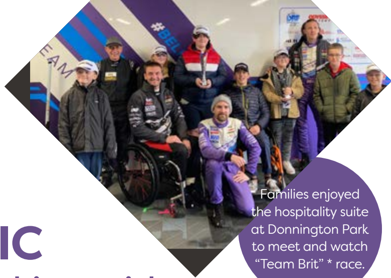
Families enjoyed the hospitality suite at Donnington Park to meet and watch "Team Brit" * race.