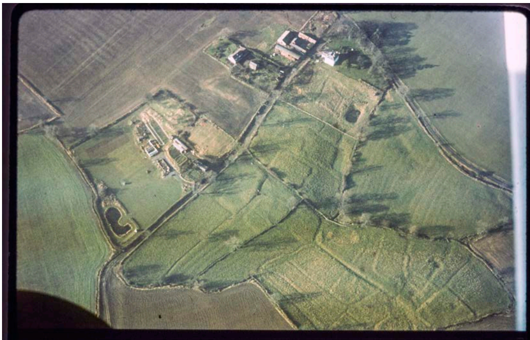
HER Ref. No. MLE1511, Frisby Deserted Medieval Village

We strive to facilitate and deliver the protection and management of the historic environment by providing good quality, authoritative information, and to promote public participation in the exploration, appreciation and enjoyment of local heritage.