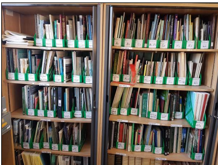
Part of the HER Reference Library at County Hall

Whilst it is not a repository for original archive or artefacts the HER does presently maintain a selected collection of reference material. This consists of books, maps, reports, photographs and other sources that are used on a day-to-day basis in the work of the HER. This can be either in the compilation of new computer records, the enhancement of existing data or to underpin advice or enquiry responses. The contents of this reference collection are listed within catalogues held by the HER. (For details of the sort of resources held by the HER please see the HER Resources document.)