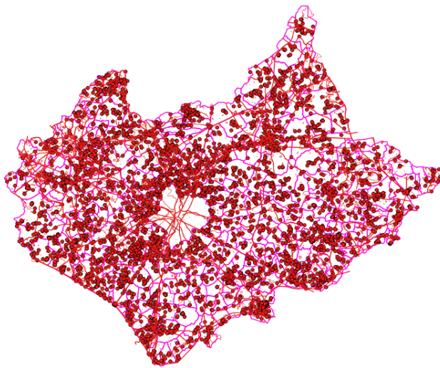
Geographical coverage: Monument records in Leicestershire & Rutland

The Leicestershire & Rutland Historic Environment Record (HER) is the principal index of known heritage assets, i.e. archaeological sites, findspots, historic buildings and landscapes recorded to date. It is also an index to past research and investigations on all aspects of the historic environment of Leicestershire and Rutland. Geographically it covers the county of Leicestershire (the districts/boroughs of Blaby, Charnwood, Harborough, Hinckley & Bosworth, Melton, North West Leicestershire, Oadby & Wigston) and the unitary authority of Rutland, but excludes the unitary authority of Leicester City, who maintain their own HER.