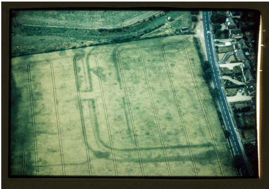
Digitised slide of the Roman fort at Great Casterton

An example of our digitisation work is the commissioning of high quality digitised versions of slides taken by Museums staff in the 1970/80s/90s. Thousands of these digital versions have been linked to the appropriate HER records; thumbnails of these can be viewed via the Heritage Gateway.